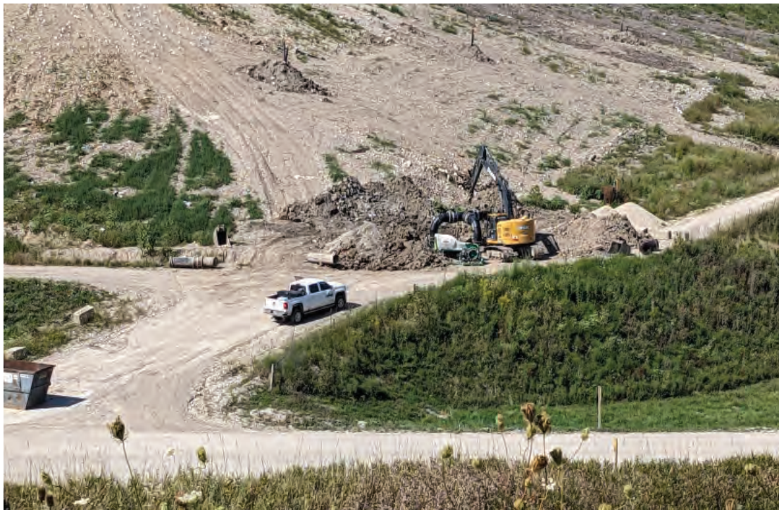
Finalizing header and flow controls at Phase 1, Northeast corner