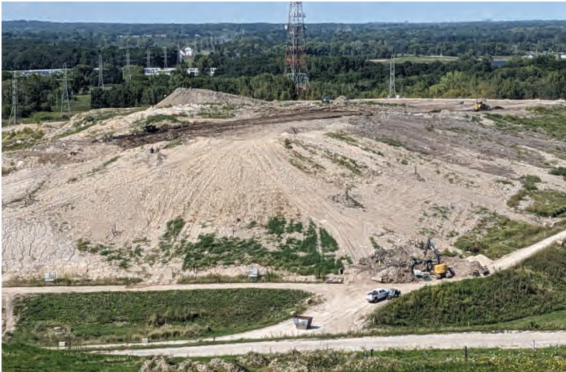
Phase 1 & 2 of North Expansion West