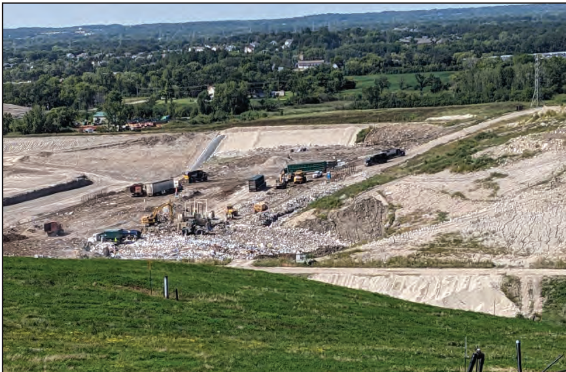
Phase 3 of North Expansion West| working face small and tight at South end of Phase 2