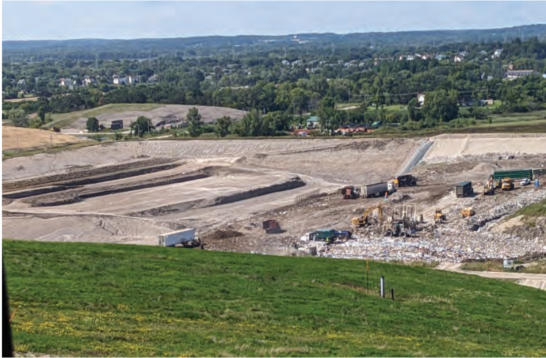
Phase 3 and future cell