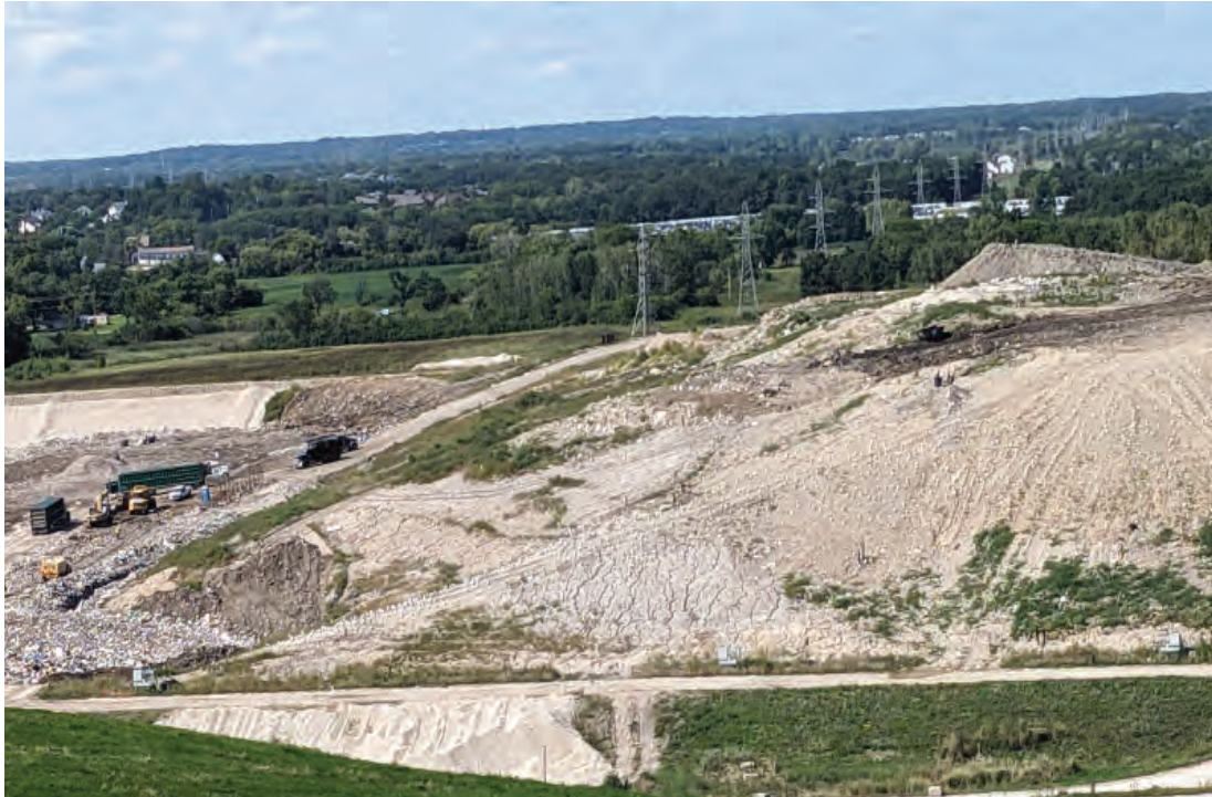
Phase 2 of North Expansion West