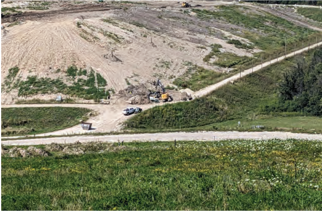
New headers and flow controls added to North Expansion West